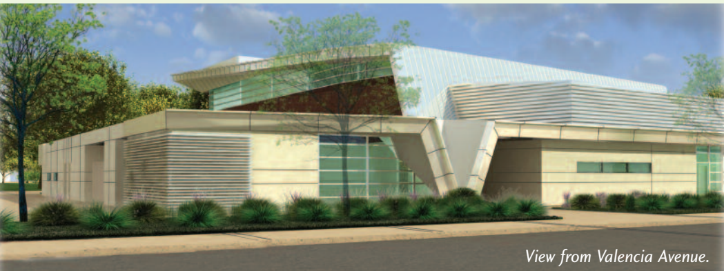
View from Valencia Avenue.

Through a partnership with the Hacienda La Puente Unified School District, the County of Los Angeles will begin construction this year on the new Hacienda Heights Community and Recreation Center. The 19,000 square foot facility will be constructed at the 7-acre site of the former Hillgrove Elementary School and will offer Hacienda Heights residents a variety of educational, social and recreational programs. Utilizing funds dedicated by the Board of Supervisors, the Community Development Commission (CDC) is managing the development and construction of the facility designed by DLR Group WWCOT Architects. The Department of Parks and Recreation will manage the facility which is scheduled to be completed in the latter part of 2013. For more information contact (909) 594-6561.